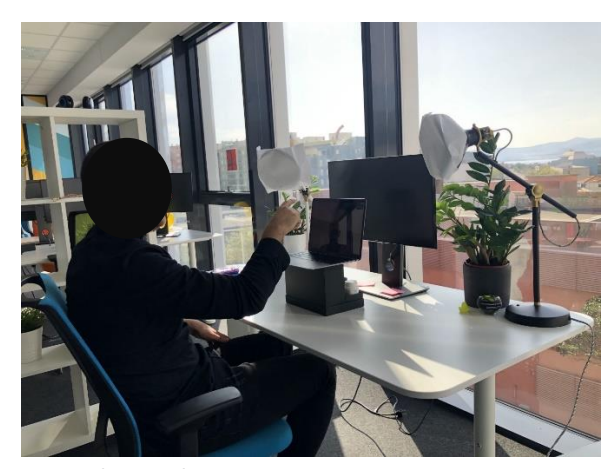
Perfect setup. Windows in front of you, light or lamps at eye height, and camera elevated.

This is one of the most important steps you must take. I cannot overstate the importance of lighting. Make sure you highlight this section.